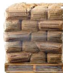
2500 lb Pallets