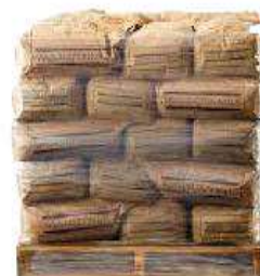
1920 lb - 2000 lb Pallets