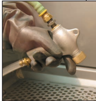
Fits the hand easily

High-production, hand-held blast cleaning gun for use in any suction blast cabinet. May be mounted in fixed position. Made from cast/machined aluminum. Gun assembly includes gun body, orifice with locknut, O-ring and nozzle holding nut. Order nozzle separately.