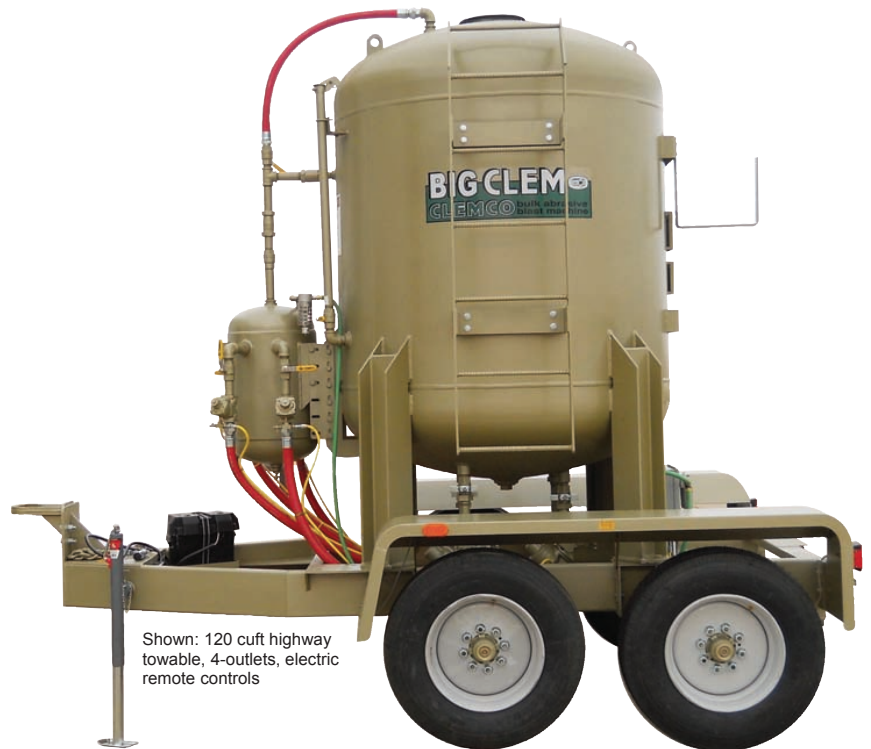
Shown: 120 cuft highway towable, 4-outlets, electric remote controls

Each operator station is fitted with Auto-Quantum (pneumatic or electric) pressure-hold remote controls, which allow each operator to start and stop independent of the others. The Quantum is an all-media valve, making it possible to switch between expendable mineral or slag abrasives to steel grit as necessary. Pneumatic remote controls are best when the blast hose is 100 feet or shorter; beyond 100 feet electric remotes are recommended to minimize the response time at the nozzle for beginning or stopping blasting.