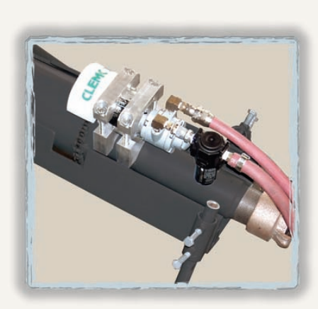
Spin-Blast HD-P air motor

For 18-inch to 48-inch pipe, the Spin-Blast HD pneumatic model uses an air motor to control the rotation speed of the blast head. Independent manual control of the blast head speed allows precise adjustments to suit the pipe surface condition and degree of cleanliness needed. The air motor can be run off the blast cleaning air supply or can be operated with its own compressor. The tool is designed to use two standard long venturi nozzles. The total compressed-air consumption of the tool will depend upon the nozzle orifice size.