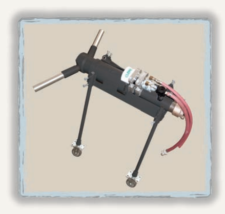
Spin-Blast HD-P Rugged construction, easy control