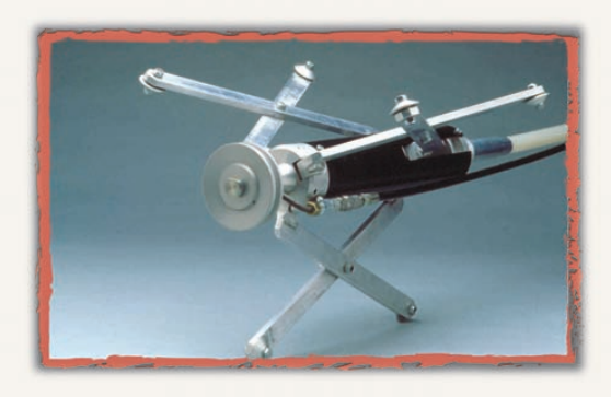
Orbiter III suits pipes from 7 inches to 37 inches.