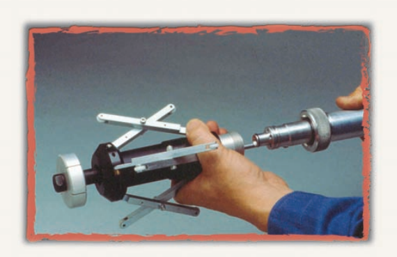
Orbiter I coats 3.5-inch through 7-inch pipes.