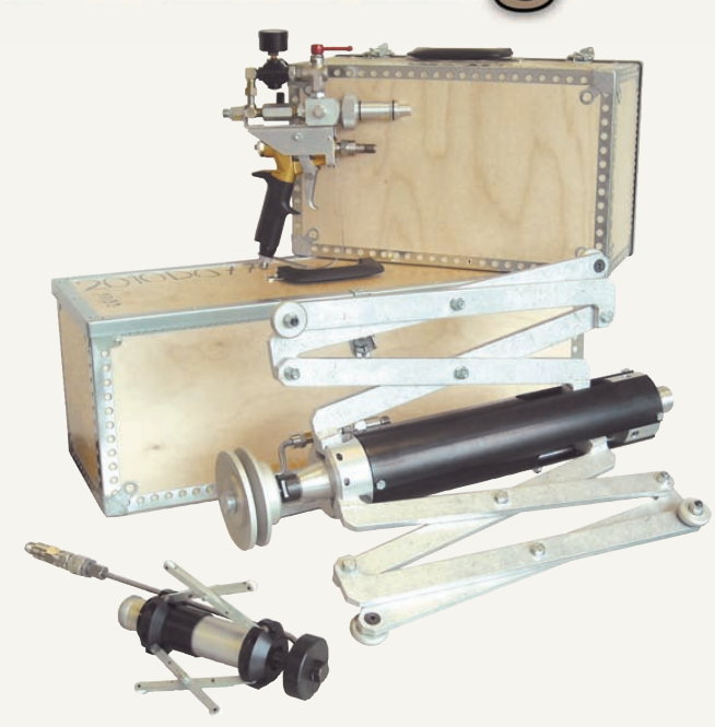
Two models cover pipe IDs from 3.5 inches through 37 inches. Each unit comes in a sturdy, stackable storage box.

The heart of the Orbiter system is the air-control assembly. From this central location, the operator controls start/stop of the rotating-head air motor, the on/off of paint flow, and the air valve and pressure regulator, which control the expansion and contraction of the centering carriage legs.