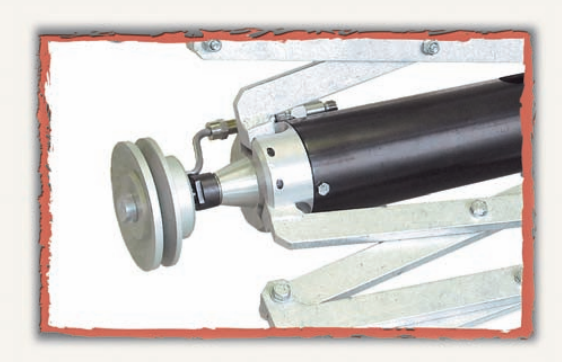
Spinning discs, moving at 10,000 rpm, propel paint for an even, uniform application by the Orbiter III shown.

The Orbiter I and III tools are each available in four packages to suit jobs with differing lengths of pipe. Choose from models with 6 feet, 12 feet, 20 feet, or 40 feet of hose. Six sizes of spray tip are available, ranging from .018 to .043 to suit the specified coating.