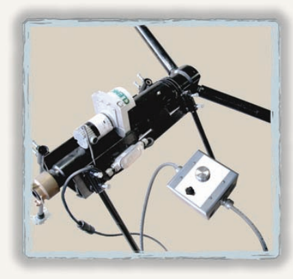
Spin-Blast HD-E with control box

Two HD models serve the needs of rugged, high-production operations. Engineered to be truly heavy-duty for real world conditions, they have few moving parts, which translates to more optimum maintenance-friendliness.