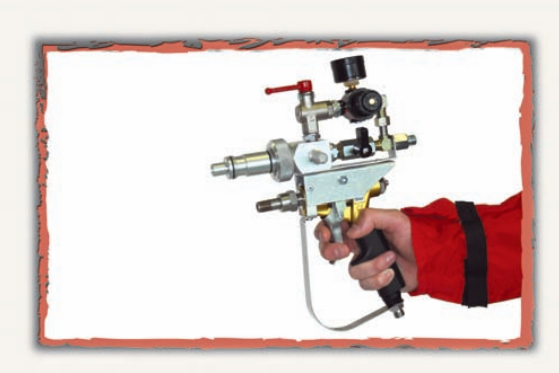
The air control assembly gives the operator all functional controls in one convenient location.

Various sizes of long-lasting tungsten carbide spray tips are available to suit the specified coating. Paint flows through the spray tip and paint tubing for metering at the head, the working end of the Orbiter. To operate the Orbiter, one operator handles the air-control assembly and paint gun; another manually pulls the tool from one end of the pipe to the other at a speed established by experience and the type of coating being applied and the thickness required.