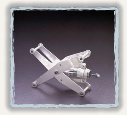
Hollo-Blast with centering carriage for 5" to 12" ID pipe