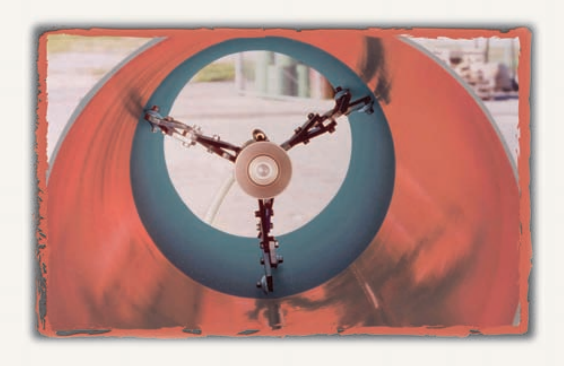
Air-motor controlled adjustable carriage legs quickly center the paint head within the pipe.

The Clemco Orbiter is engineered to provide high performance with a wide variety of industrial coatings, offering value over the course of a long s ervice life.