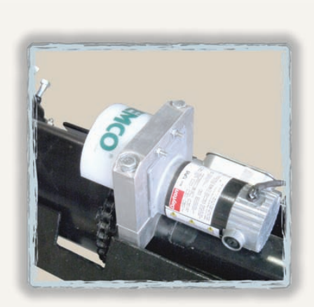
Spin-Blast HD-E electric motor

The Spin-Blast HD electric model is for 18-inch to 137-inch pipe diameters. The motor is controlled by a simple-to-operate control box with an on-off switch and a knob to control the RPMs of the DC motor, which controls the blast head speed. By manually controlling the blast head speed, the operator can vary the dwell time for more efficient blast cleaning. The HD-E does not require AC electric power; and does not consume expensive compressed air beyond the needs of the nozzles. the motor is capable of producing 4.5 inch pounds at 25 RPM; and has 100:1 gear ratio providing the necessary torque for large, highproduction blast nozzles for large diameter pipe.