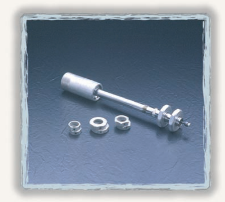
Hollo-Blast Jr. is sold with four sets of centering collars