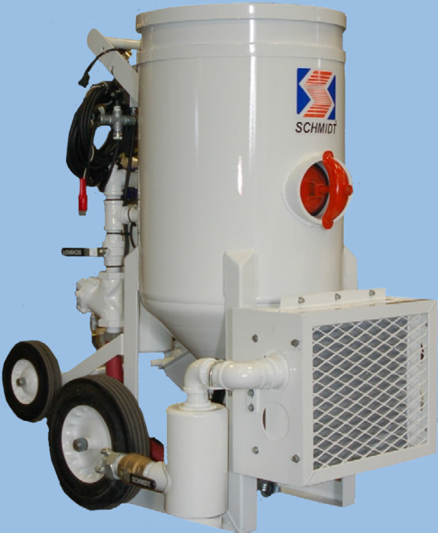
6.5 cu ft blaster x 400 cfm aftercooler See reverse for details.