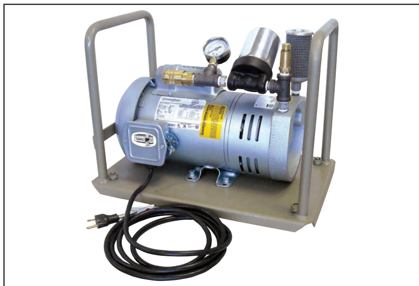
Clemco's CALIPSO single operator air pump

The Clemco CALIPSO Ambient Air Pump, is a cost-effective alternative to a breathing-air compressor. It provides an oil-free air supply for low-pressure, type CE, supplied-air respirators used for abrasive blasting or for any NIOSH-approved continuous flow hood or helmet-style respirator approved to operate at 10 psi or less. [Note: Clemco offers two 4-operator models — see CAP-4 data sheet no. 21999.]