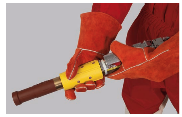
Leather Gloves 02243